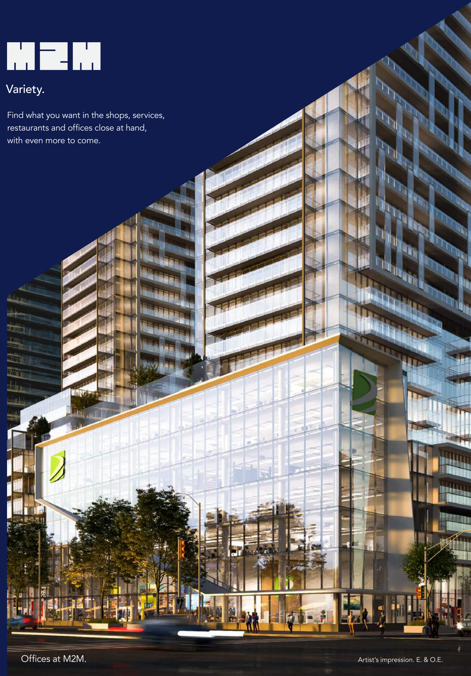
Offices at M2M.

Find what you want in the shops, services, restaurants and offices close at hand, with even more to come.