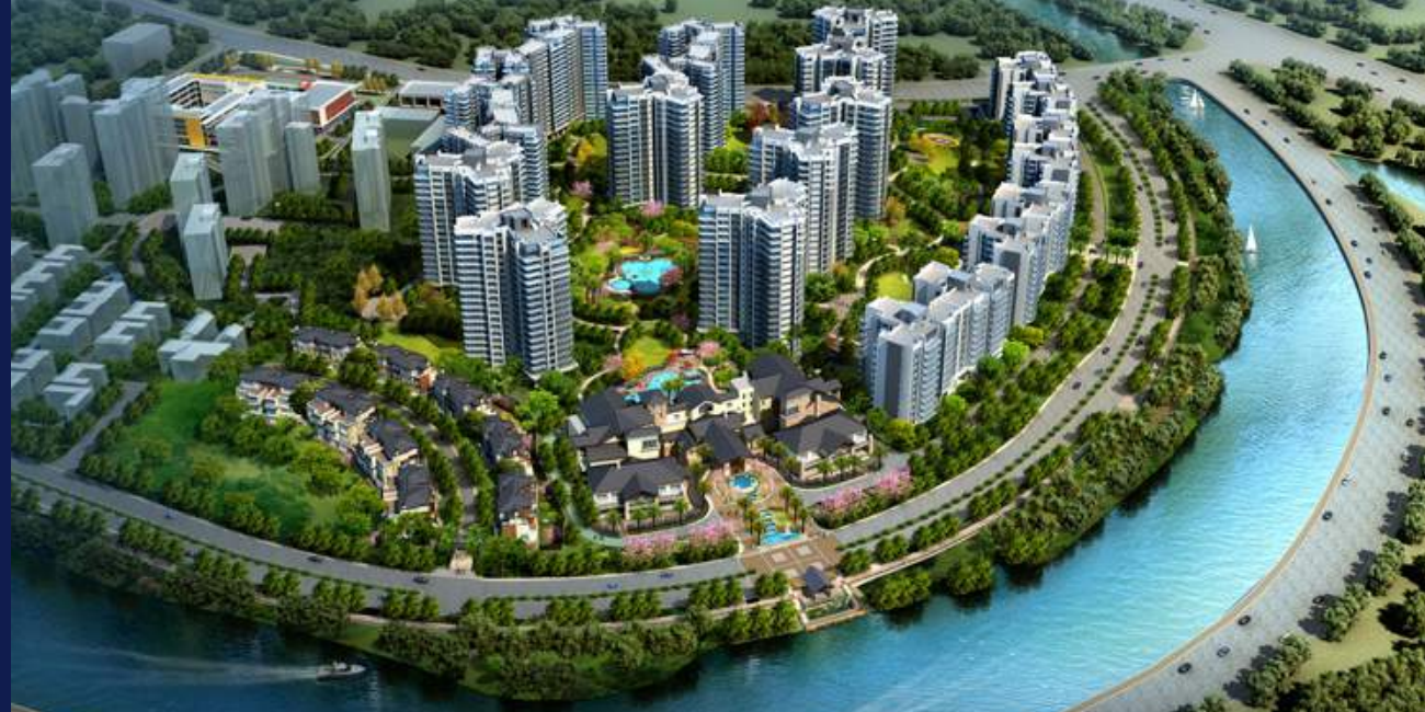
Lianfeng State (Guangzhou, China): Pacific Coast Builder Conference 2017 Golden Nugget Awards Award of Merit Winner, Best International Residential Project 150,000 sq.m. of residential adjacent to a beautiful golf course.