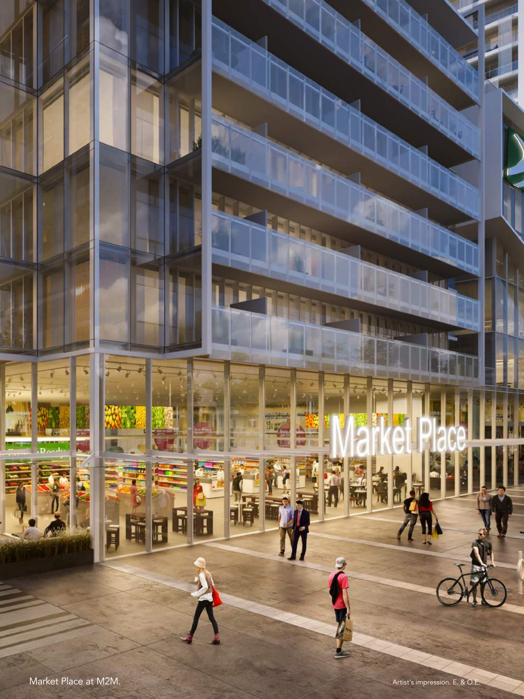
Market Place at M2M.