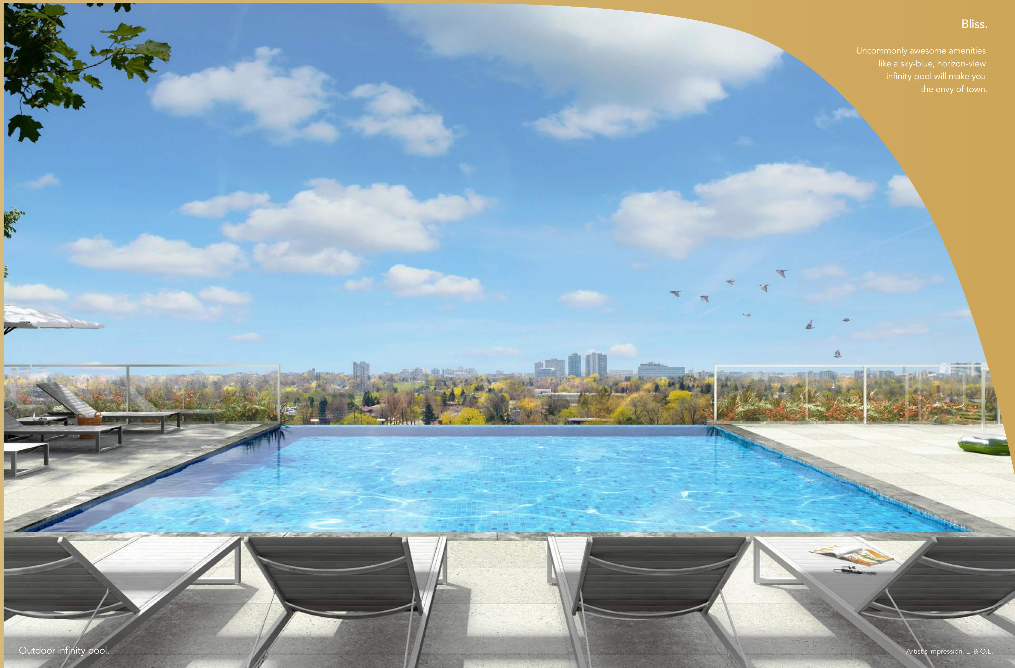
Outdoor infinity pool.

Uncommonly awesome amenities like a sky-blue, horizon-view infinity pool will make you the envy of town.