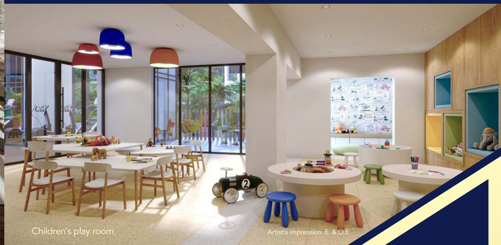
Children's play room.