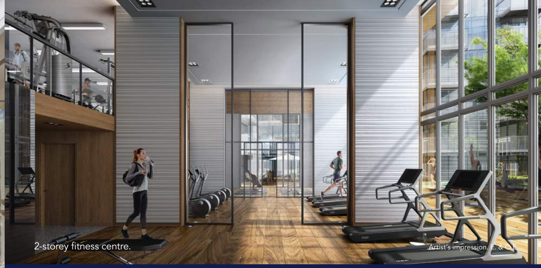
2-storey fitness centre.