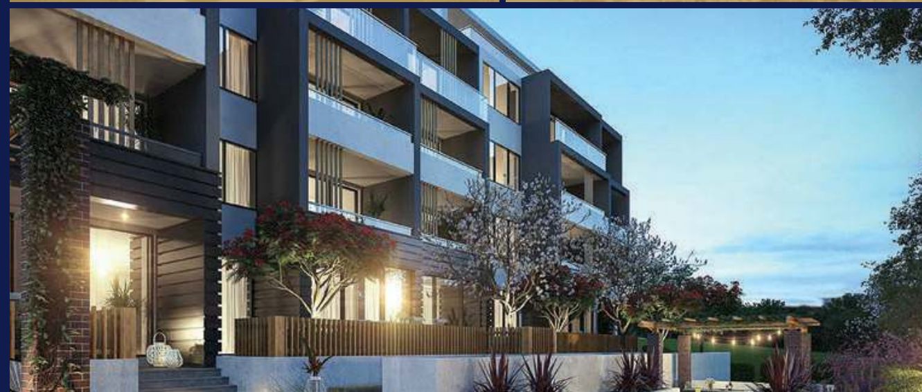
Mirabell Turrumurra (Sydney, NSW, Australia)