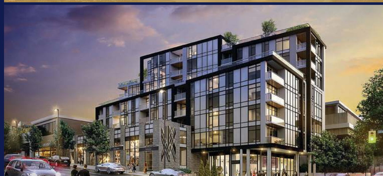
The Granville (Vancouver, BC, Canada)