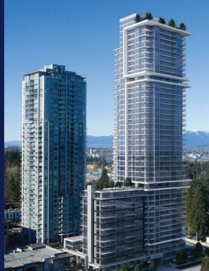
One Central (Surrey, BC, Canada)