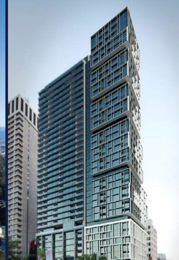
One30 Hyde (Sydney, NSW, Australia)