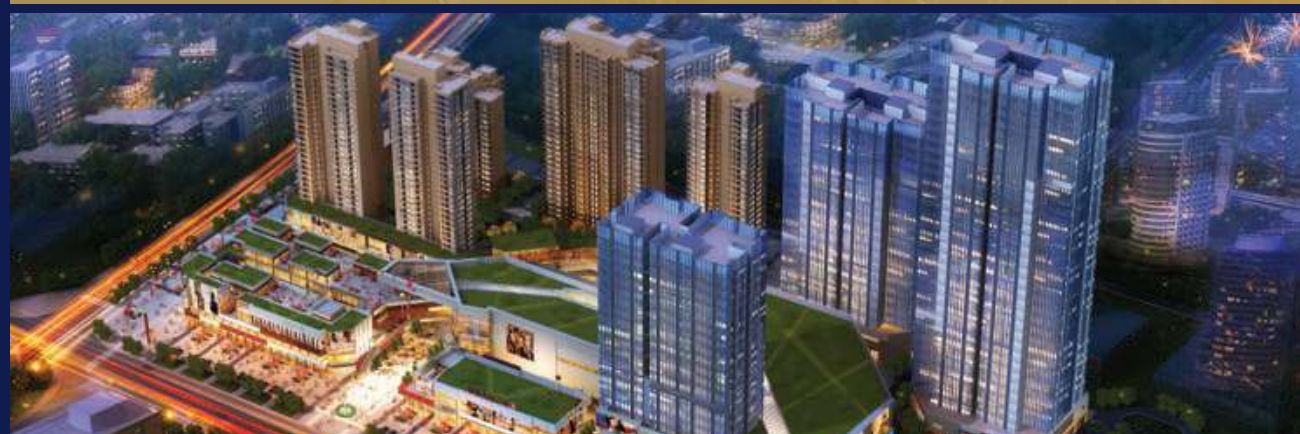
Zhuhai Aoyuan Plaza (Zhuhai, China): 460,000 sq.m. of high-end residential and commercial complex, including a large scale shopping mall, pedestrian friendly retail streets, office building, and star high end hotel.