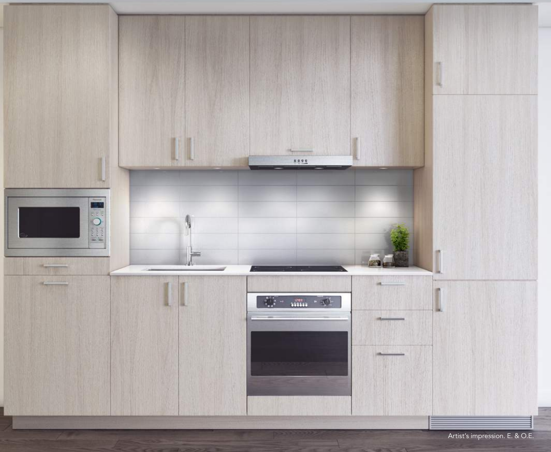
Artist's impression. E. & O.E.