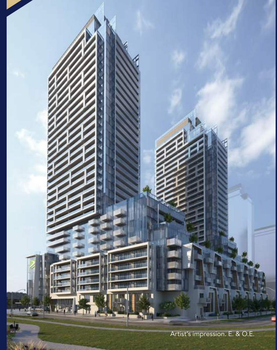
Artist's impression. E. & O.E.

Situated in the heart of North York, T1 is en route to anywhere in the Greater Toronto Region. Hop on the subway, GO transit or expressway and arrive with ease and speed.