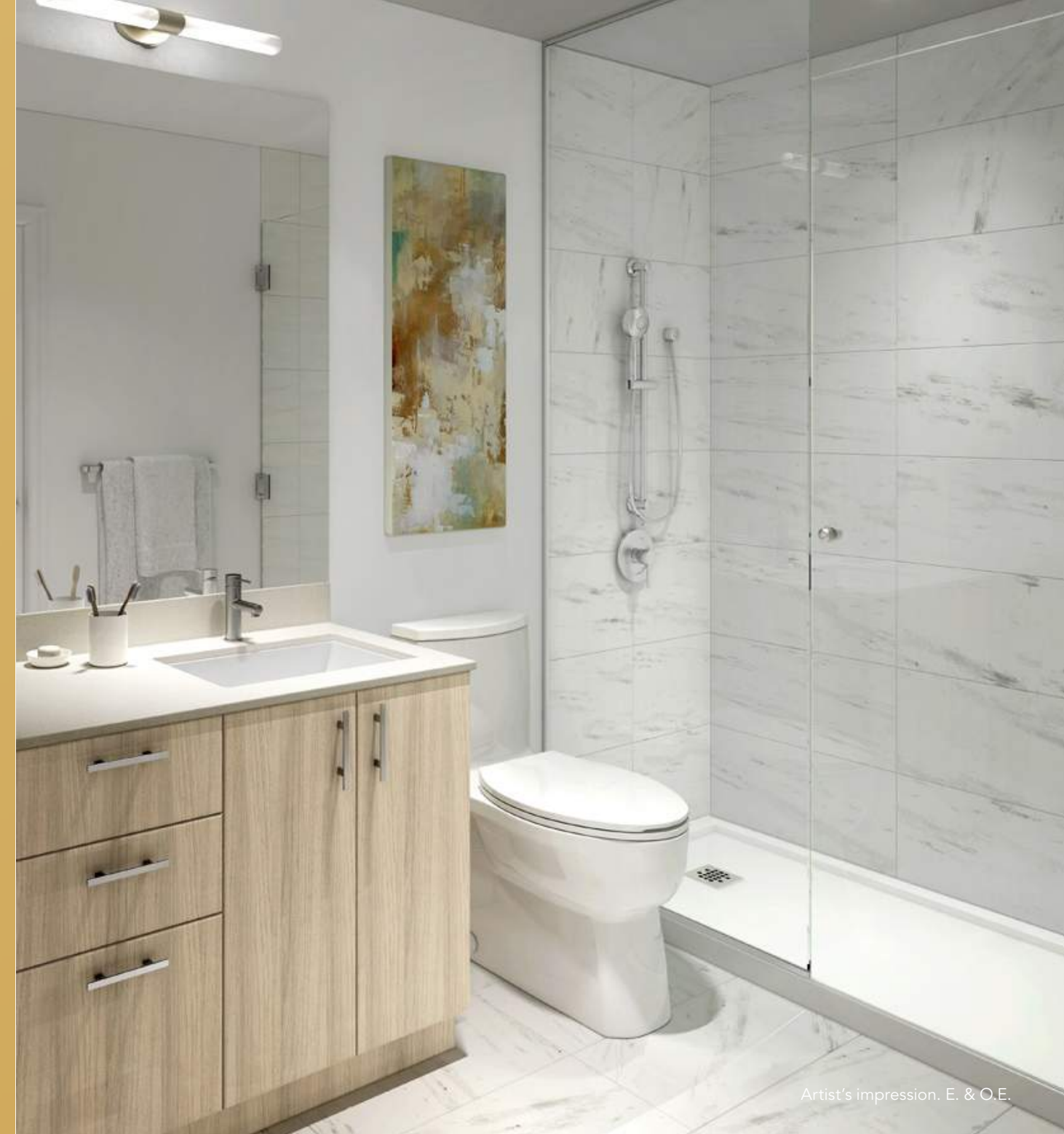
Artist's impression. E. & O.E.