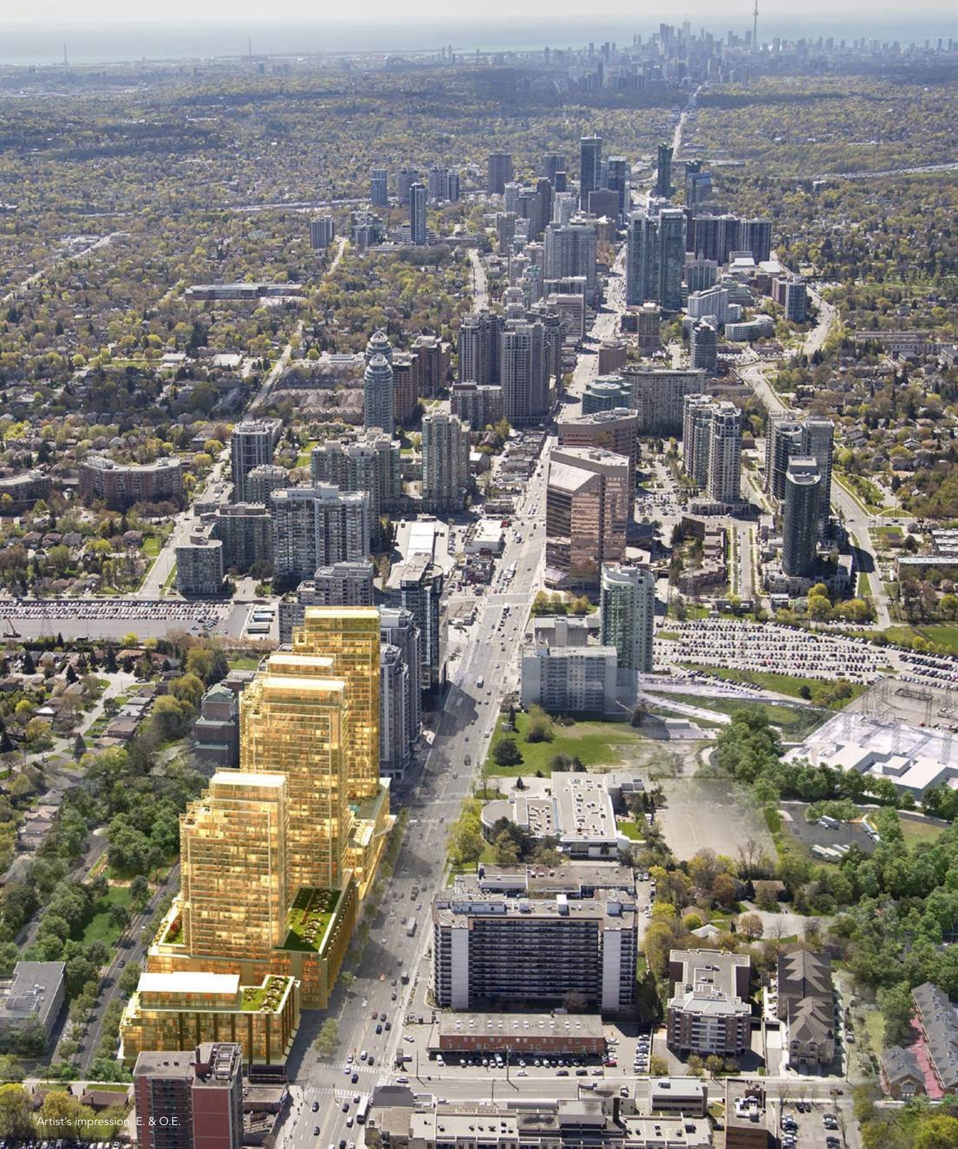
Artist's impression. E. & O.E.