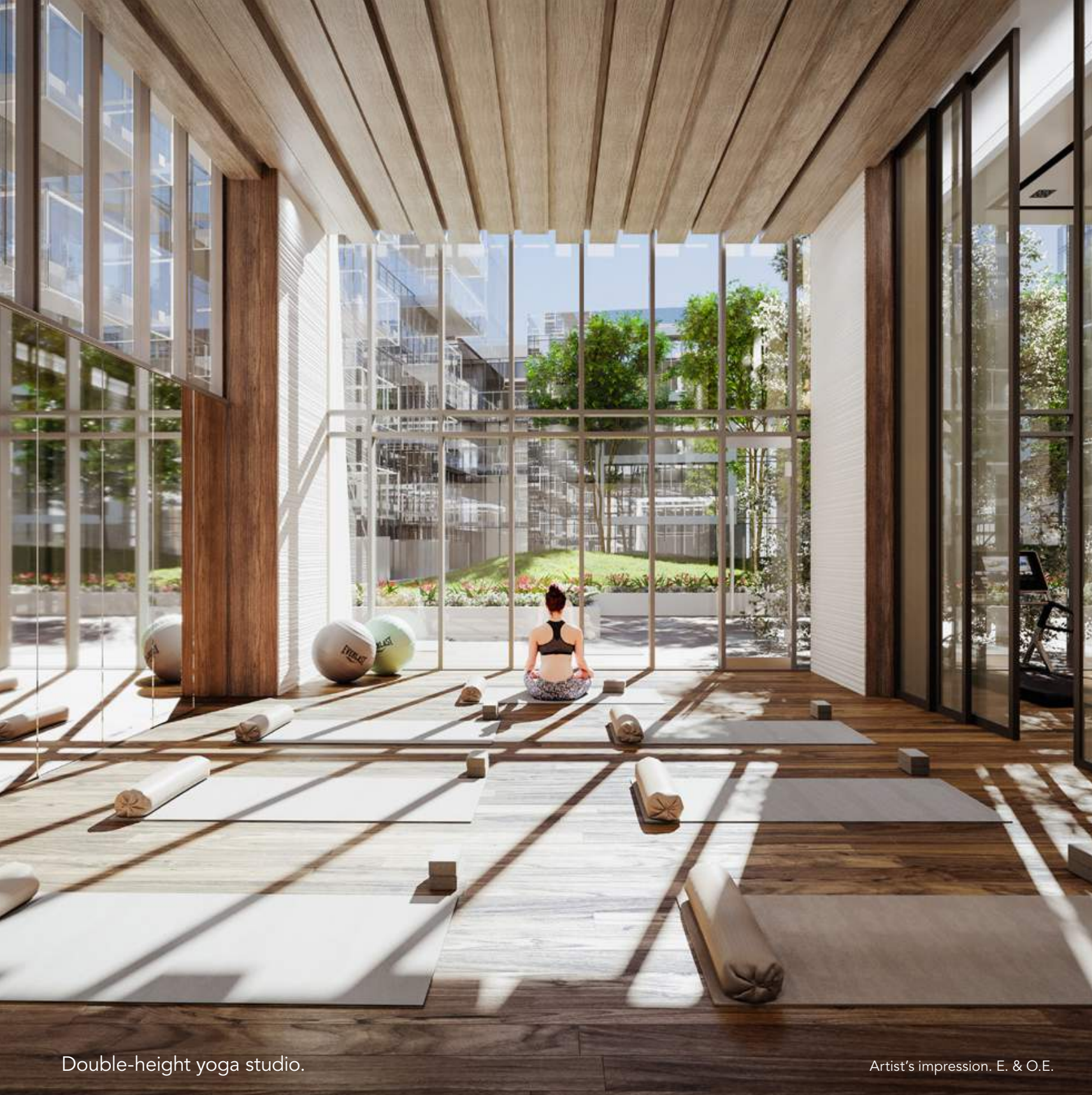
Double-height yoga studio.