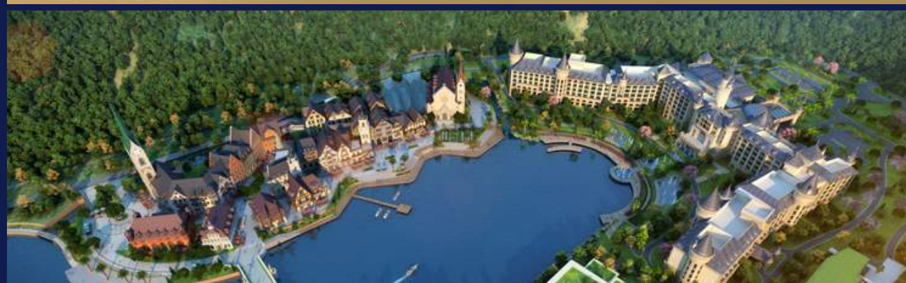
Yingde Xinhua Town (Chocolate Kingdom) (Qingyuan, China): A cultural tourism and recreational resort complex, set to become an impressive and diversified themed recreational landmark in South China. 1,300 acre divided into five zones: Chocolate Kingdom Themed Wonderland, Yinghong Town Tea Farm, Hilton Hotel, Aoyuan Hot Spring Resort, Karst Hoodoo Hot Spring Water World and Karst Landscape Leisure Pasture.