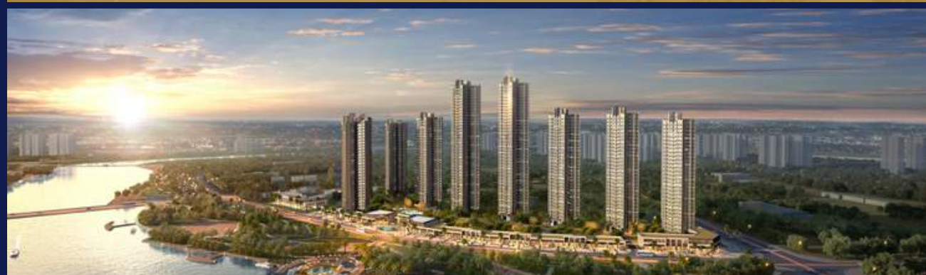
Yushan Lake (Huizhou, China): A beautiful residential and commercial community with an ecological park located in the "Top Ten Livable Cities" in China. Landscaping designed in world famous New Asianism with subsided courtyards, roof top and community gardens.